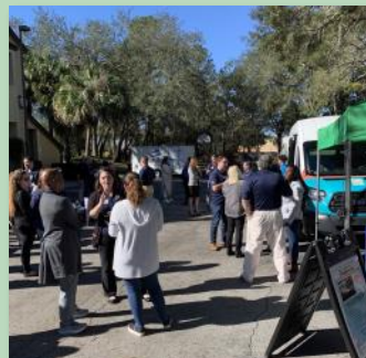
On January 6th, the Mobile Health Unit team participated in the Leadership Seminole Healthcare Day.